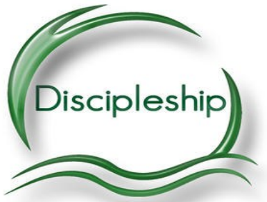
Young Adult Class