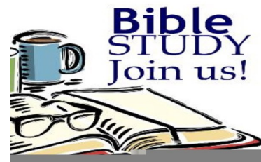
New Bible Study Discussion Class

All these Sunday morning classes are dismissed for the summer. They will start back in September.