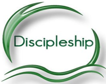
Young Adult Class