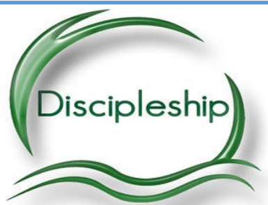
Young Adult Class